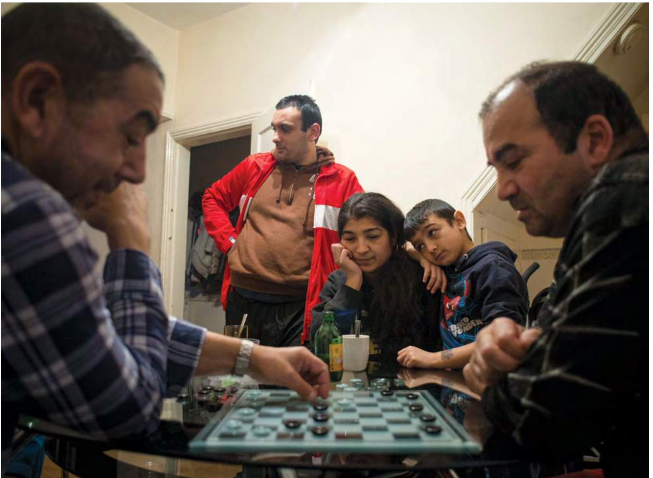
Czech Roma on Teesside

'To close the employment gap between Roma and non-Roma, the EU Framework calls on Member States to ensure Roma non-discriminatory access to the open labour market, self-employment and micro-credit, and vocational training. Member States were encouraged to ensure effective equal access for Roma to mainstream public employment services, alongside targeted and personalised guidance and mediation for Roma jobseekers, and to support the employment of qualified Roma civil servants'. 81