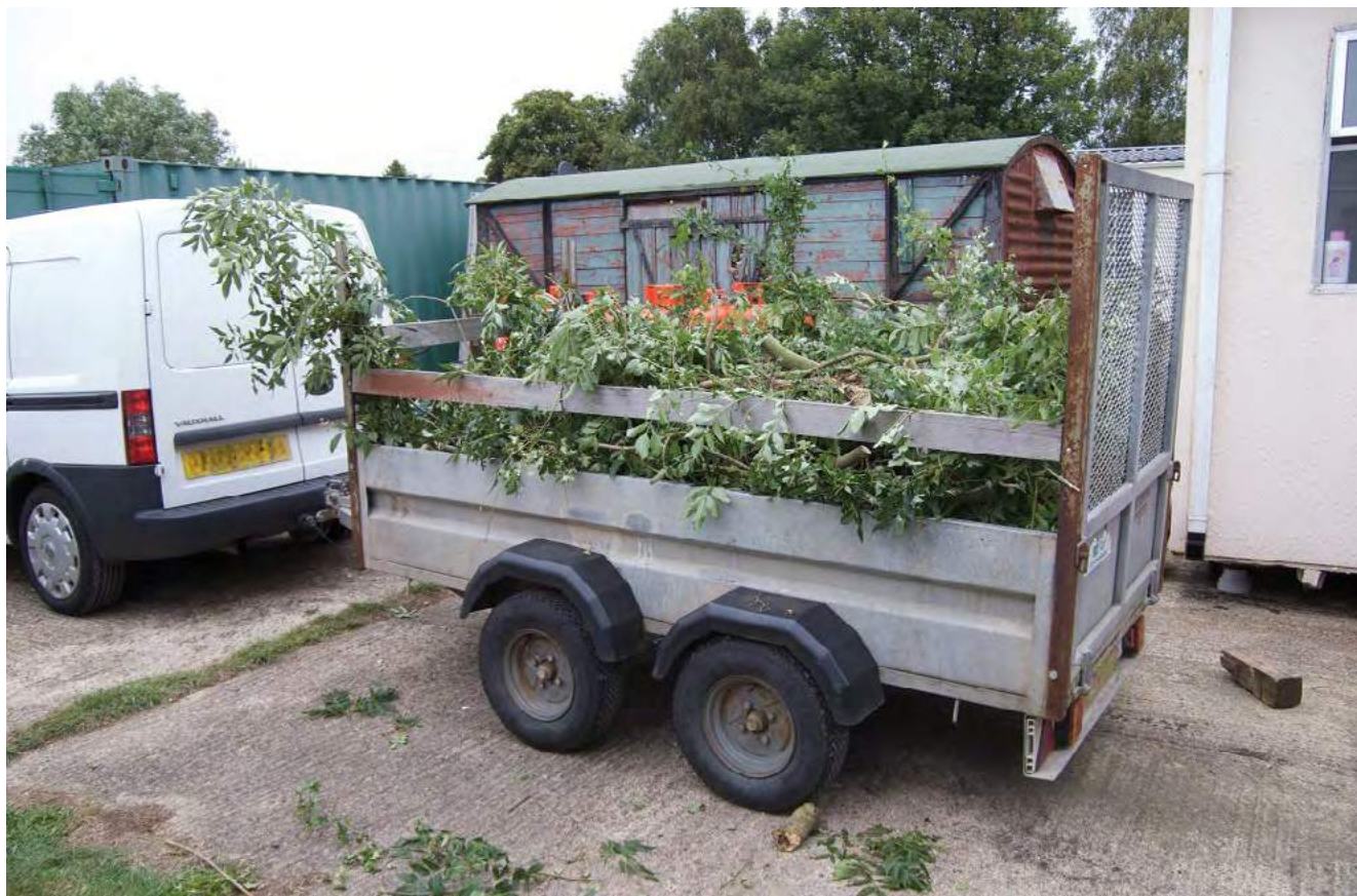
Traditional Gypsy Employment