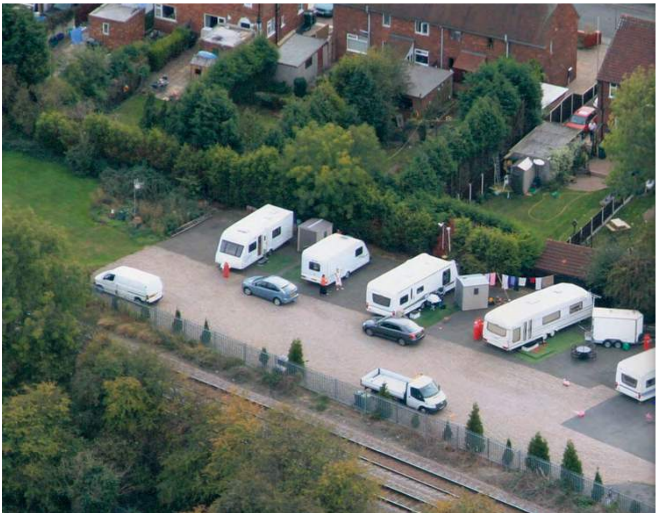
Gypsy family Site