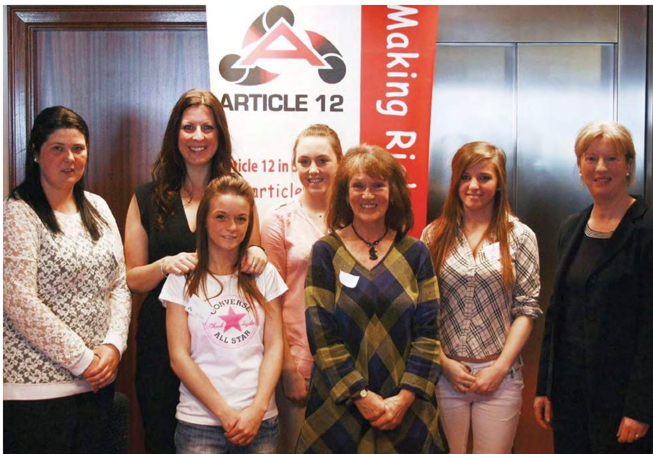
Article 12, Youth Equality Group Scotland

benefits for 'Roma' communities. 11 It is disheartening to read that the European Commission monitoring report on UK 'Roma' Integration (2014) continues to show that a lack of monitoring data means that any progress on 'Roma' integration is difficult to identify. 12 While there have been some small local projects working to improve integration, the Gypsy, Traveller and Roma communities who were consulted for this report, consider that these major streams of EU funding are yet to 'trickle down' into their communities. From the perspective of the community members lived experience, there seems to be little discernable change in the quality of their lives and experiences of social exclusion.