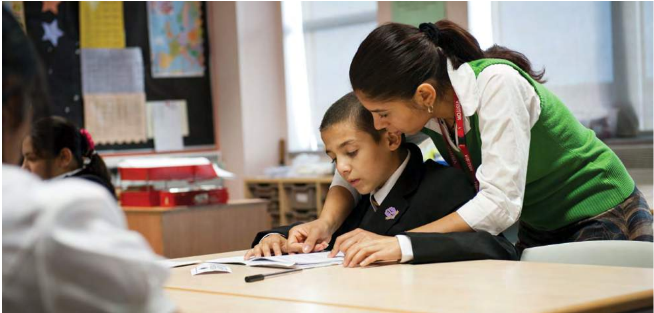
Roma Teaching Assistant and Roma Pupil

It wasn't the fight with just Roma people it was the white and Asian people as well. They used to take into school like a knife.'