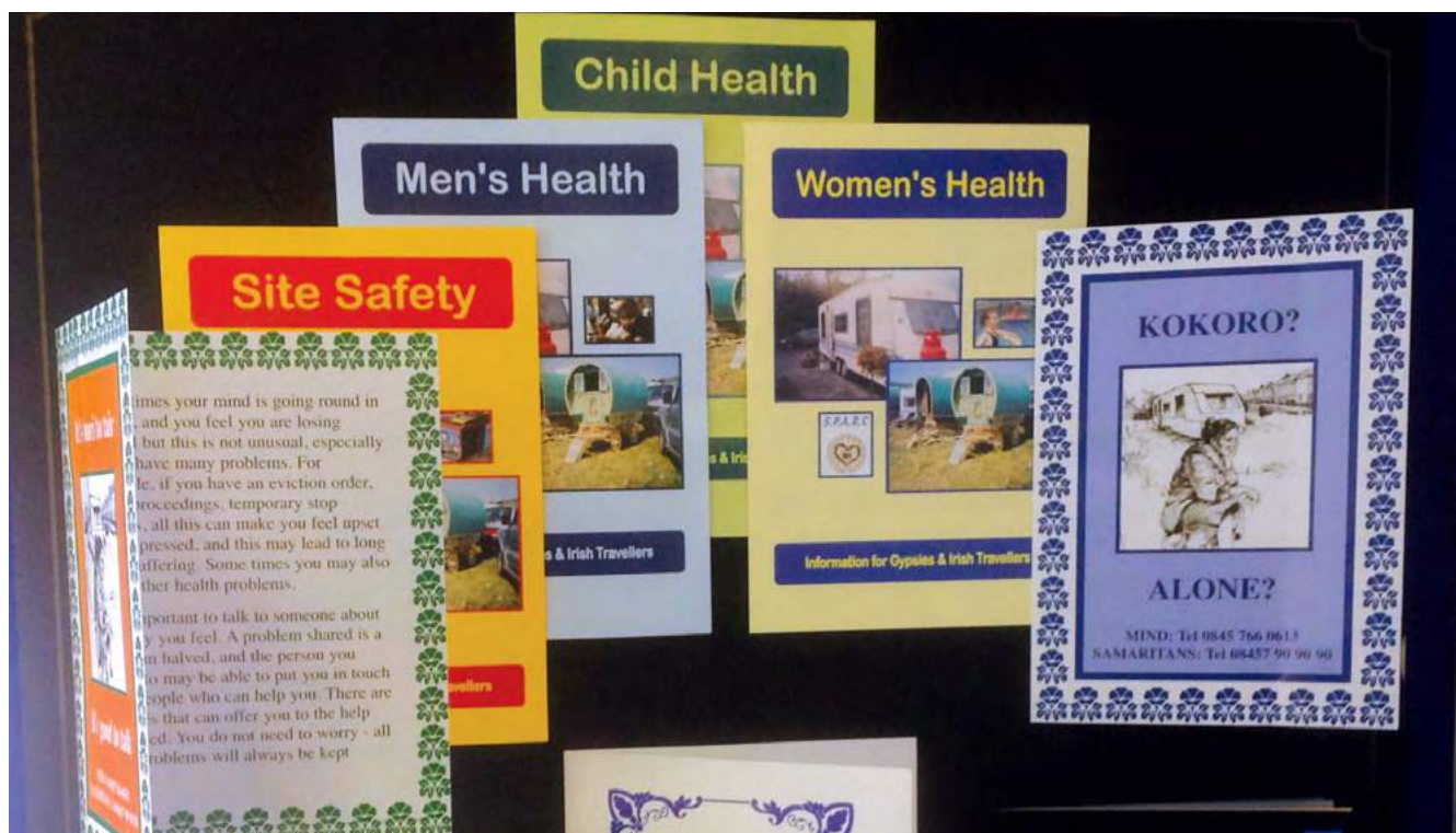
Community groups work to disseminate health information as in this example by Derbyshire Gypsy Liaison Group

To reduce the health gap between the Roma and the rest of the population, the EU Framework calls on Member States to provide access to quality healthcare, especially for children and women, and to preventive care and social services at a similar level and under the same conditions as the rest of the population. The poor health of Roma is very closely linked to social, economic and environmental factors. People in vulnerable situations often have trouble in navigating in the health system and in articulating their needs. 95