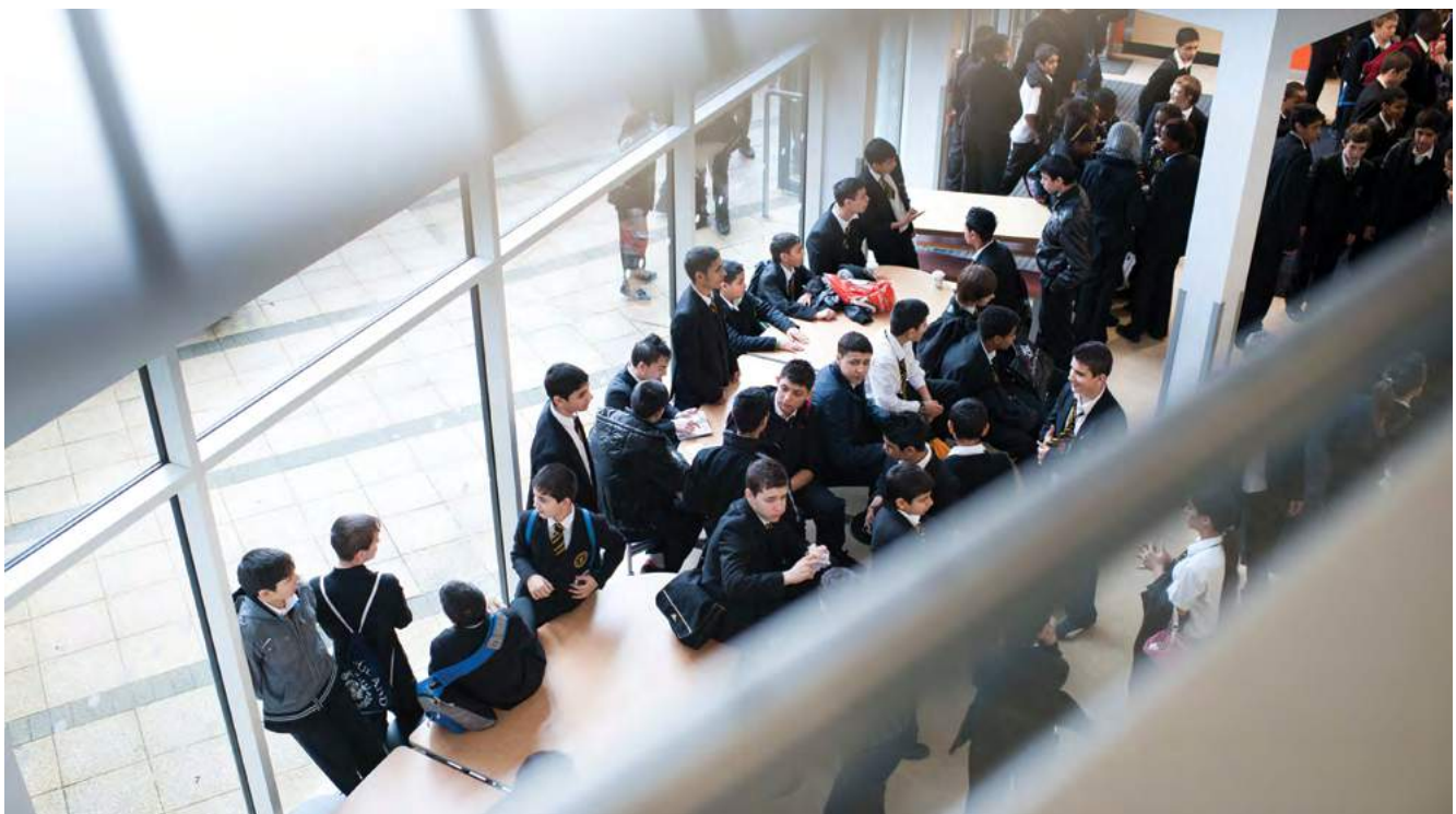
Roma pupils