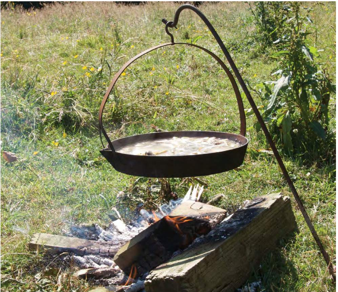
Fire and food a traditional scene for all the communities

Significantly, the EU has used the term 'integration' in all of its 'Roma' integration documentation. Gypsy, Traveller and Roma communities in the UK are clear that they are calling for integration not assimilation into the dominant culture. Community members are seeking equality of rights, opportunities and access to services and to be treated as equal citizens.