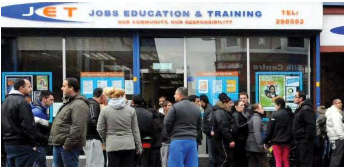
Roma waiting outside employment agency