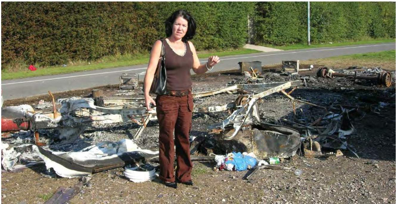
Irish Traveller and burnt out trailer (arson attack)

positive way would be to go down the path of the social media because with Twitter you have a flowing dialogue and somehow that dialogue might help to change attitudes. For example if a woman is abused she has made some opinion and then somebody sent abusive tweets to this woman and thousands of other people come down like a ton of bricks. And it might be that those of the sorts of the dialogues, particularly with the younger generations and those are the ones need to be heard now. If somebody came up with something abusive about Travellers it is continuously and vigorously challenged every time it happens. ‘